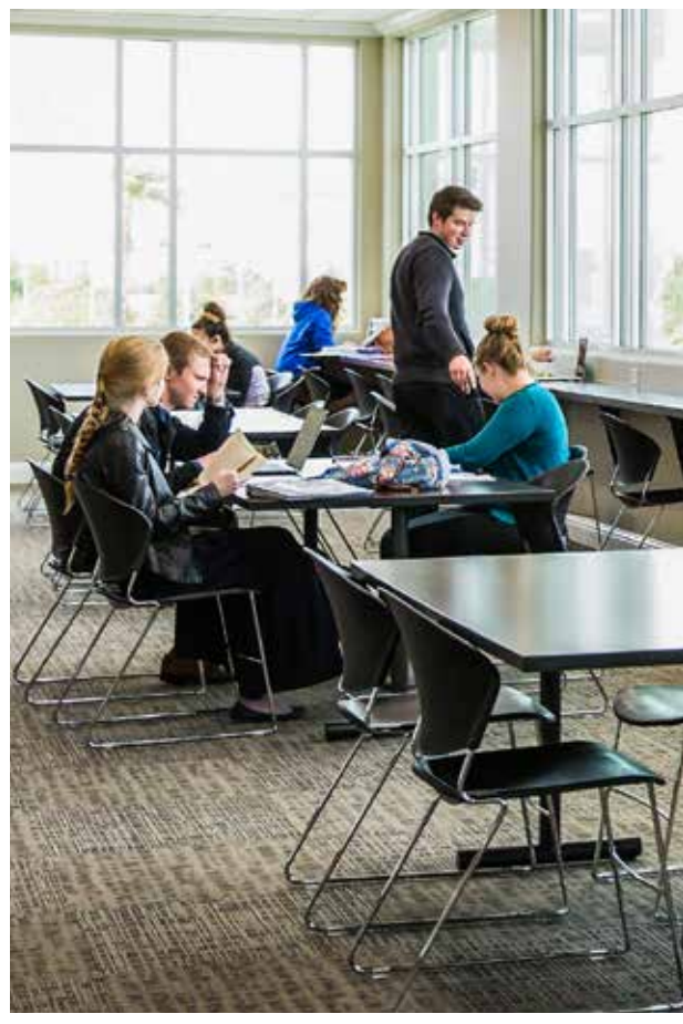
LEFT: The New Walther Center Library is now open with over 100,000 volumes